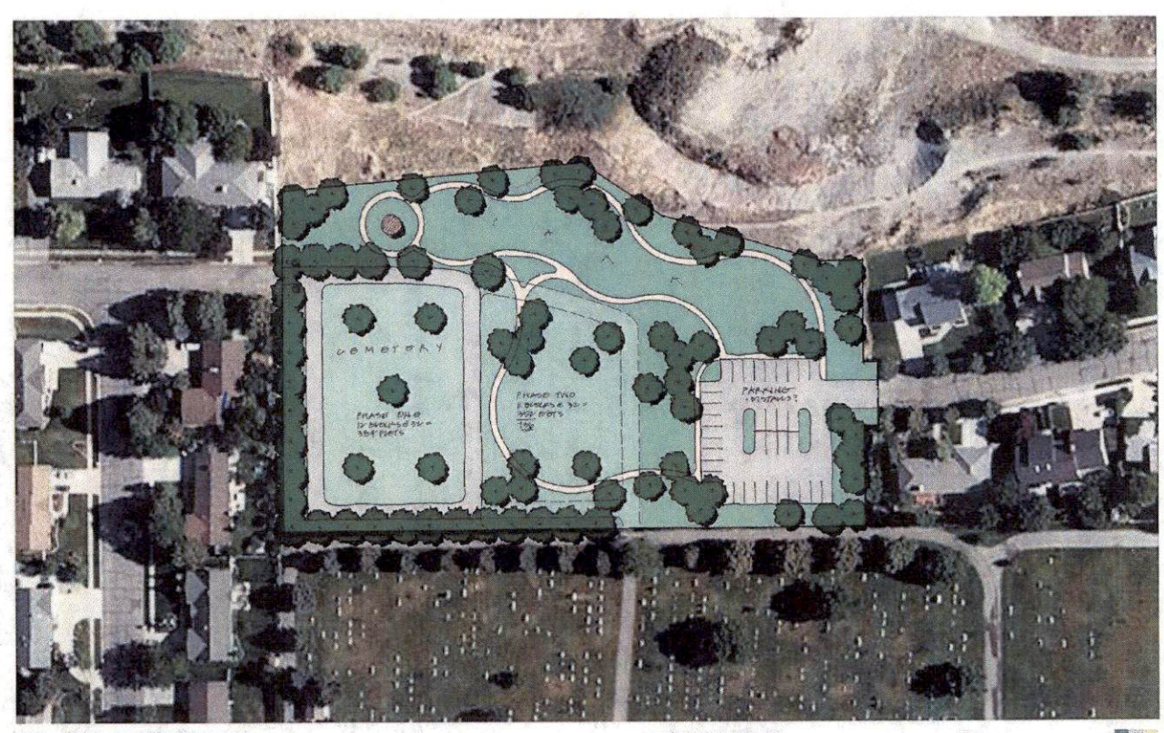
PROPOSED CEMETERY/PARK CITY OF RIVER HEIGHTS

There is no road through the park so there is more room for burial plots. Phase One estimates room for 384 burial plots; Phase Two is larger accommodating 736 plots. A parking lot accessed from Stewart Hill Drive East serves 37 vehicles. Walking paths meander throughout and a gazebo is provided.