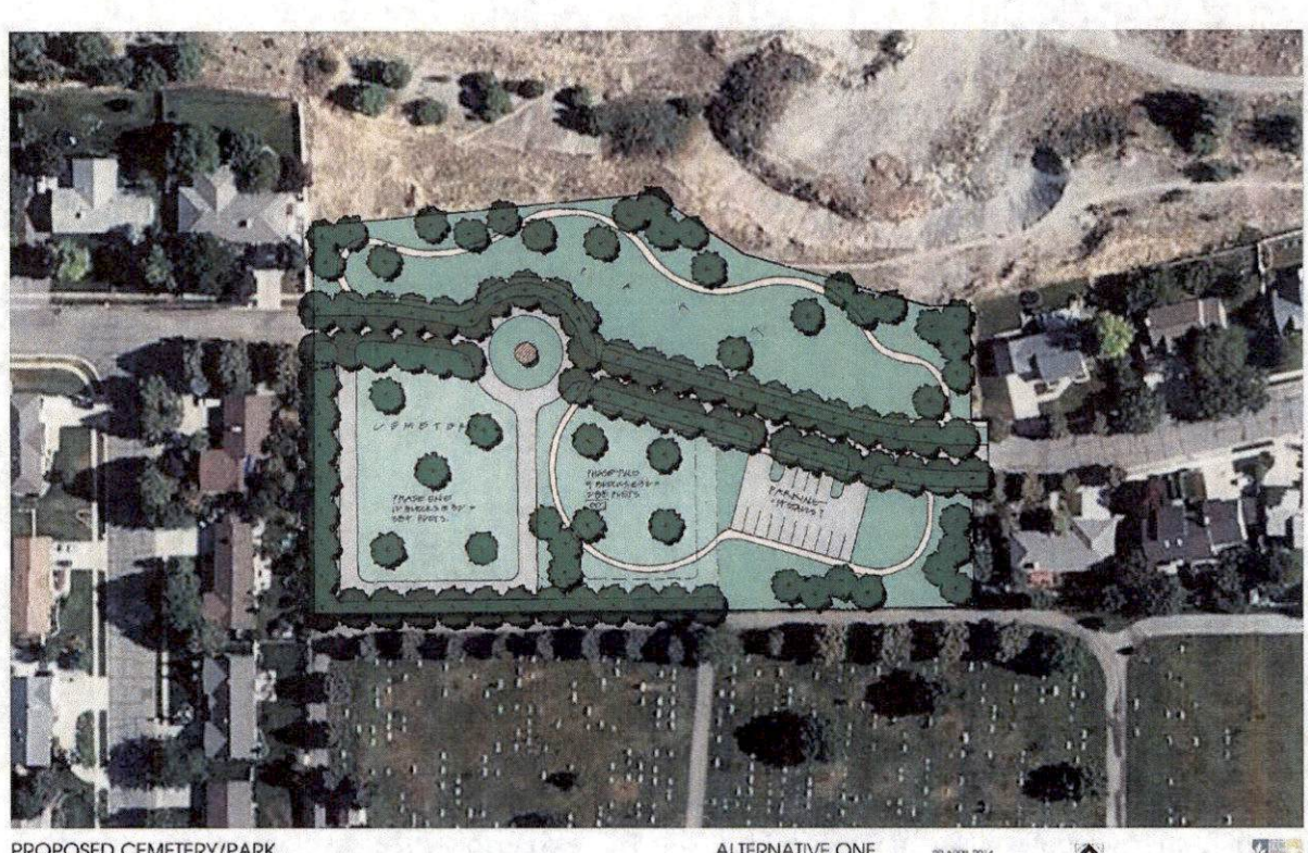
PROPOSED CEMETERY/PARK CITY OF RIVER HEIGHTS

There are two phases of cemetery development on the south: Phase One estimates room for 384 burial plots; Phase Two estimates room for 288 plots. A narrow cemetery road goes through the park with a roundabout in the center designed to add interest and slow traffic. Parking for 14 vehicles are provided south of the road and east of the cemetery plots. Open park space and walking paths are provided north of the road.