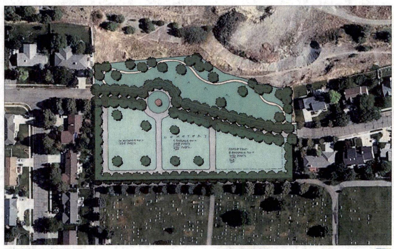
PROPOSED CEMETERY/PARK CITY OF RIVER HEIGHTS

A narrow cemetery road goes through the park with a roundabout designed to add interest and slow traffic. Parking would be along one side of the road or in the adjacent neighborhoods, which allows more space for burial plots. Burial plots could be developed in three phases: Phase One estimates room for 384 burial plots; Phase Two for 288 plots and Phase Three for 256 plots. Open park space and walking paths are provided north of the road.